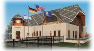
Future Location 2017